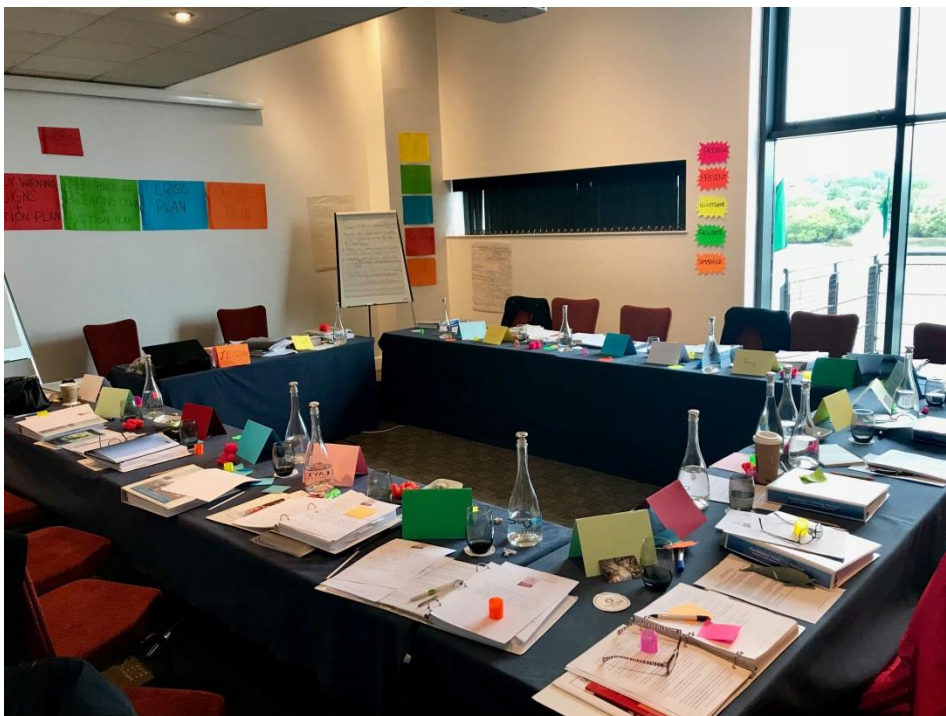
Lots of learning in evidence in the WRAP training room!

The participants also completed 4 practical elements that included: presenting from a personal perspective and presenting and responding to questions on the curriculum.