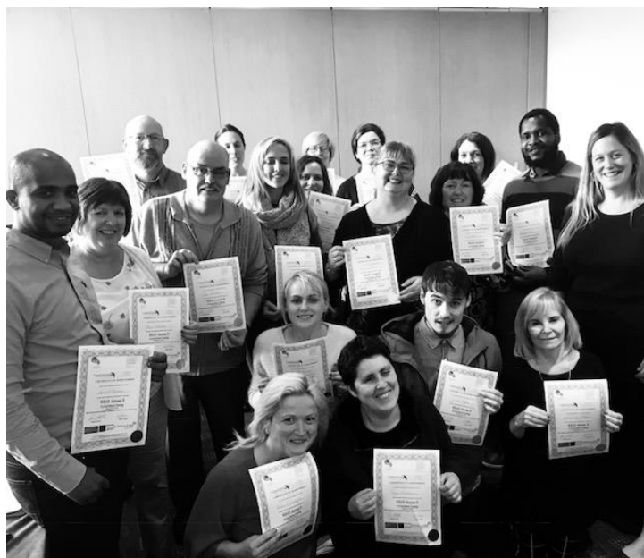
Newly accredited WRAP community facilitators

The 18 newly certified WRAP community facilitators will now be paired into 9 teams of co-facilitators. In 2019, they will receive mentoring from WRAP Advanced Level Facilitators as they plan and commence delivery of WRAP Seminar 1 in their own communities/target groups. Overtime, it is hoped that some of the newly accredited WRAP Facilitators will apply to do WRAP Seminar 3 and become accredited to train more community facilitators, thereby extending the reach and potential impact of this successful mental health support.